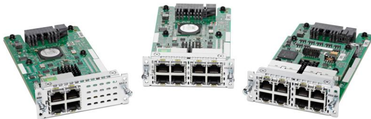
Figure 1. 4-Port, 8-Port, and 8-Port PoE/PoE+ Cisco Gigabit Ethernet LAN Switch Network Interface Modules

The new features for the Gigabit Ethernet LAN Switch NIMs include four quality-of-service (QoS) queues per port, Shaped Deficit Weighted Round Robin (SDWRR), dynamic secure port, intra chassis cascading, up to 30W of PoE/PoE+ per port, and PoE per-port monitoring and policing.