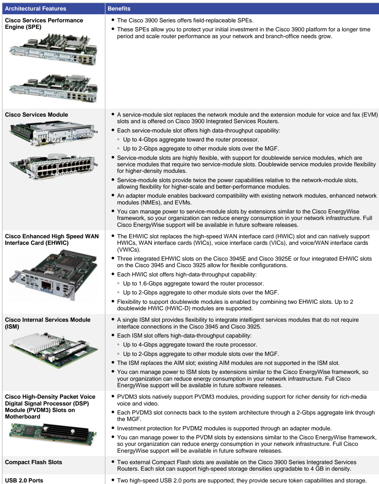
Table 3. Modularity Features and Benefits