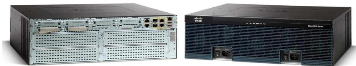
Figure 1. Cisco 3900 Series Integrated Services Routers

Cisco® 3900 Series Integrated Services Routers build on 25 years of Cisco innovation and product leadership. The new Cisco Integrated Services Routers Generation 2 (ISR G2) platforms are architected to enable the next phase of branch-office evolution, providing rich-media collaboration and virtualization to the branch office while maximizing operational cost savings. The new routers support new high-capacity digital signal processors (DSPs) for future enhanced video capabilities, high-powered service modules with improved availability, multicore CPUs, Gigabit Ethernet switching with Cisco Enhanced Power over Ethernet (ePoE), and new energy visibility and control capabilities while enhancing overall system performance. Additionally, a new Cisco IOS® Software Universal image and Cisco Services Ready Engine (SRE)® module enable you to decouple the deployment of hardware and software, providing a flexible technology foundation that can quickly adapt to evolving network requirements. Overall, the Cisco 3900 Series offers exceptional total cost of ownership (TCO) savings and network agility through the intelligent integration of market-leading security, unified communications, wireless, and application services.