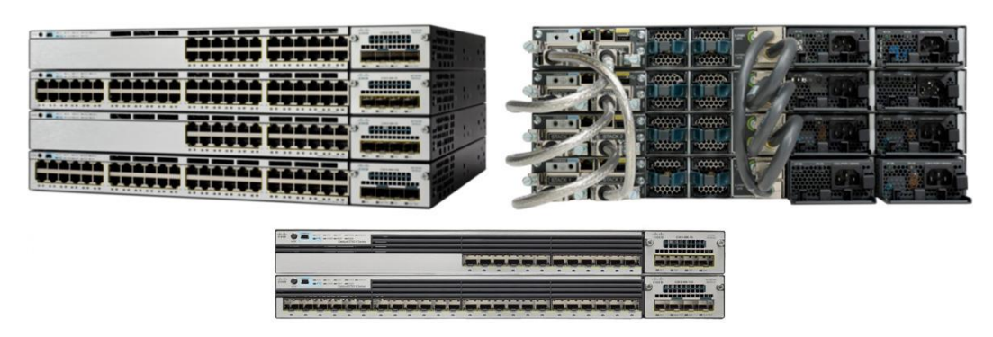
Figure 1. Cisco Catalyst 3750-X Series Switches (Front and Back)

Table 1 shows the Cisco Catalyst 3750-X Series configurations.