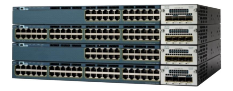
Figure 2. Cisco Catalyst 3560-X Series Switches

Table 2 shows the Cisco Catalyst 3560-X Series configurations.