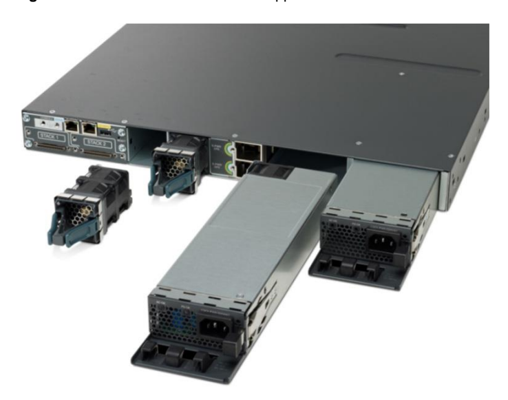
Figure 5. Dual Redundant Power Supplies

Table 6 shows the different power supplies available in these switches and available PoE power.